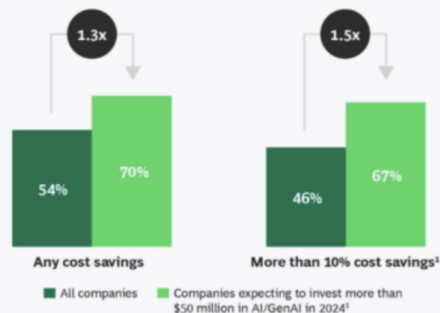
Percentage of companies expecting cost savings in 2024

Source: BCG AI Radar (2024); n = 1,406 in 50 markets.